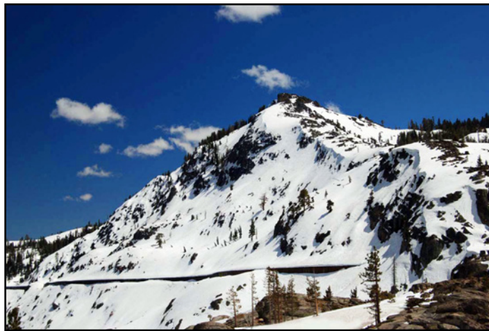
Donner Summit and the railroad in snow sheds.