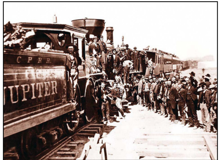
The railroad is complete.